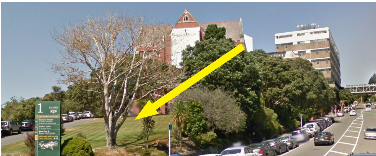
Earthquake Evacuation Assembly Point