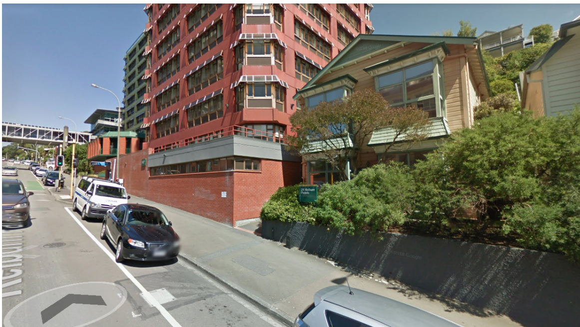
Fire Evacuation Assembly Point (for 24 Kelburn Parade, von Zedlitz & Murphy Buildings)