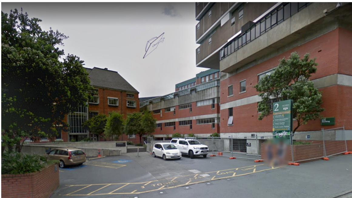
Fire Evacuation Assembly Point (for Kirk Building)